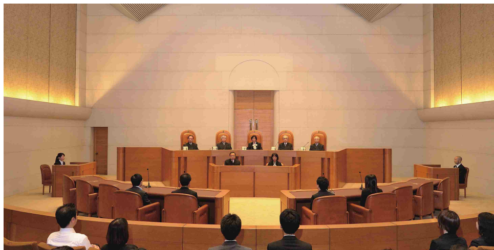
Courtroom of the Petty Bench of the Supreme Court (Jul. 2014)

judge in which no appeal is normally permitted, if the grounds for appeal are the involvement of a constitutional violation or a material conflict with judicial precedent.