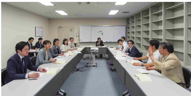
Meeting of a Committee for the Inquest of Prosecution

The members of Committees for the Inquest of Prosecution are selected at random from among citizens who are eligible to vote for members of the Diet's House of Representatives. There are 165 such committees throughout the country, each composed of 11 members. Each is totally independent, and the law stipulates that these committees not be subjected to any external influence or instruction. The primary duty of the committees is to consider whether or not a public prosecutor's disposition not to institute