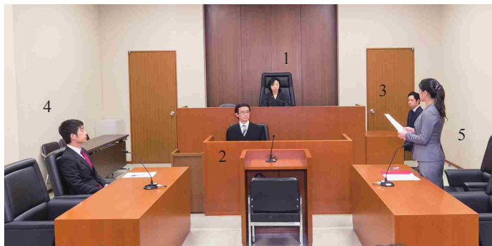
Single-judge courtroom (civil case)