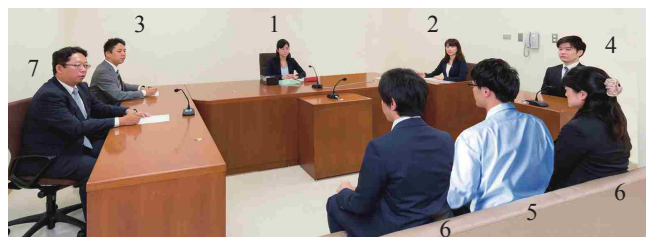
Juvenile case hearing

Family courts also deal with juvenile cases. They have jurisdiction over juveniles aged 14 to 19 who have committed or are likely to commit a crime, and over persons under 14 years old who have violated or are