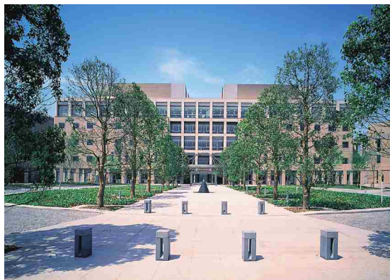
Legal Training and Research Institute

The Legal Training and Research Institute is affiliated with the Supreme Court, and in addition to educating and training legal apprentices who have been admitted by the Supreme Court from among those who have passed the National Bar Examination for the legal profession (judges, public prosecutors, and attorneys), the institute also provides and plans various training and research for judges. As a rule, the training at the institute and successful completion of a final qualifying examination are required in order for a person to join the legal profession.