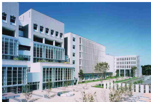
Training and Research Institute for Court Officials

Court Clerks, who are judicial experts with highly sophisticated legal education, are responsible for being present at court proceedings and keeping detailed judicial records (authentication of court proceedings) in order to ensure due process of law. Additionally, they assist the judges in research of