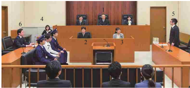
Three-judge courtroom (criminal case)