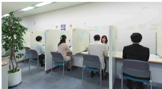
Consultation center in a Summary Court

There are 438 summary courts in Japan, and these are the most accessible to the people. Summary courts have jurisdiction over civil cases in which the disputed sum does not exceed 1,400,000 yen, and over criminal matters punishable by fines or lighter punishment and certain statutory crimes such as theft and embezzlement. Summary courts are not vested with the power to impose a term of imprisonment without work or harsher punishment. However, imprisonment with work for not more than three years may be imposed as specially permitted under the law. And if a summary court feels that a sentence of imprisonment with work for more than three years is appropriate, the court transfers the case to the district court. It should be noted that all trials in summary court are handled by a single judge.